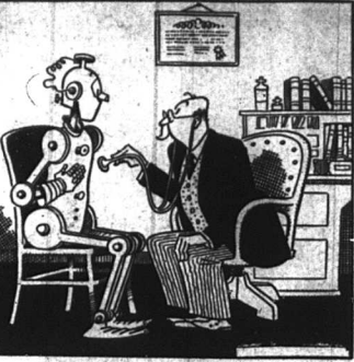
"Doc, I got a funny clicking noise in my chest!"