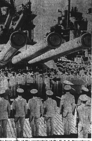
Under huge guns of the quarterdeck of the U. S. S. Pennsylvania at Honolulu, the new commander in chief of the U. S. fleet, Admiral Husband E. Kimmel (arrow) reads orders from the deck of the new command ship, the USS Pennsylvania, as he is greeted by the staff of the new command. Admiral James O. Richardson, retiring commander in chief, stands in the background.