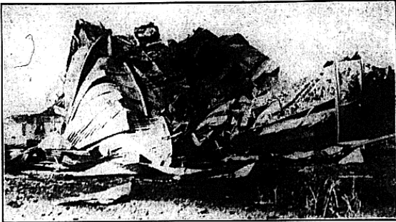
En la gráfica que presentamos a nuestros lectores, pueden darse cuenta de las pérdidas que ocasionó el incendio que se registró el domingo por la mañana en la bodega de maíz de la Compañía Banko L. Miller que se encontraba ubicada en las cercanías de Adams Gardens...