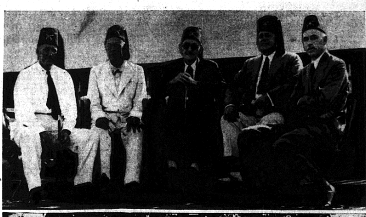
Through the cooperation of schools and other organizations the Shriners were able to put on an exceptionally colorful show preceding the football game at the Honolulu stadium Saturday afternoon.

SHRINERS HAD BIG DAY AT THE HONOLULU STADIUM SATURDAY