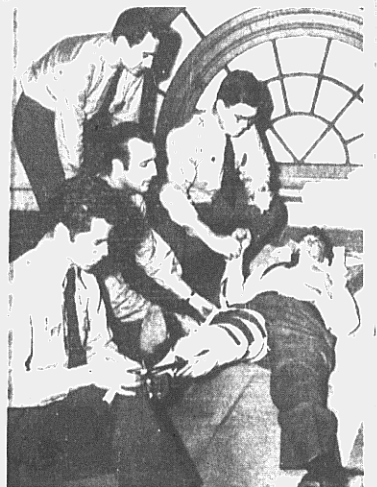
CUSTOMS MEN PREPARE These members of the U. S. customs service with other employees in the federal building are taking first aid courses and otherwise practicing preparedness.